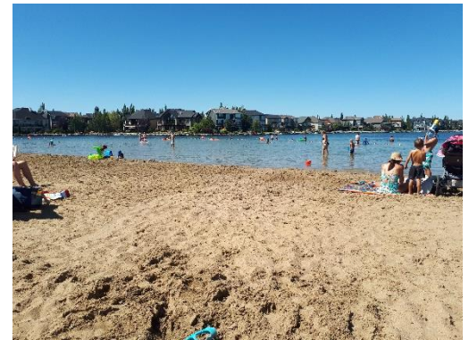
Auburn Bay lake in summer