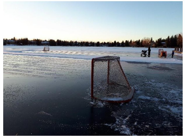
Midnapore Lake in winter